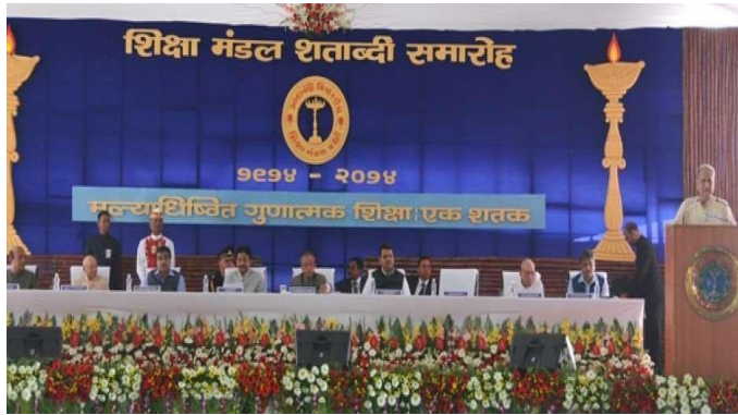
Hon'ble President of India along with other dignitaries during Shiksha Mandal's Centenary Celebrations