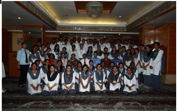
Students at a workshop "Foreign Exchange & You" in association with RBI, Mumbai