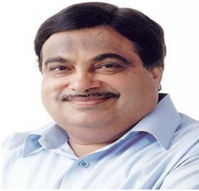
Shri Nitin Gadkari Union Cabinet Minister, Road Transport and Highways; and Shipping