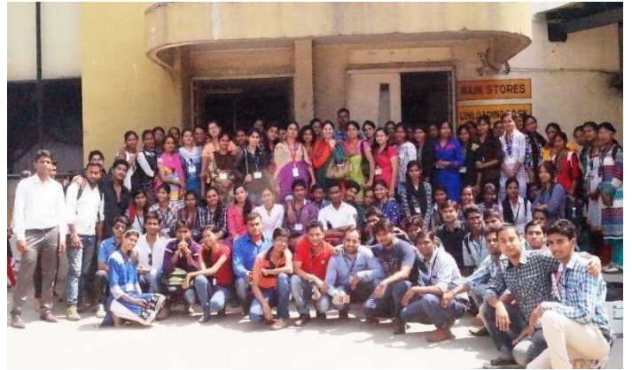
Team DMSR on an Industrial visit to Dinshaw's Dairy Foods Ltd