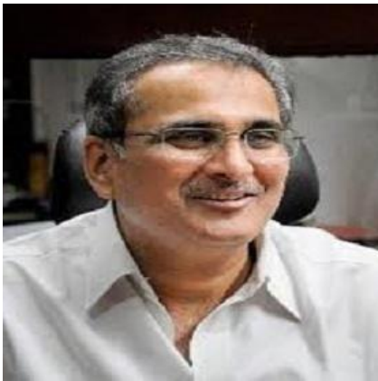
Shri Sunil Manohar Ex-Advocate General, Govt of Maharashtra