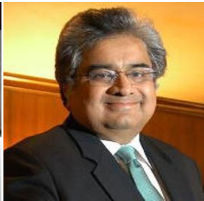
Shri Harish Salve Supreme Court Lawyer Ex-Solicitor General of India